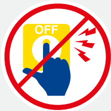
06. SYSTEM OVERRIDE