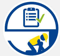
08. CONFINED SPACE