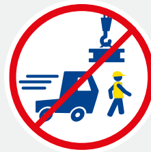
11. MOVING OBJECTS