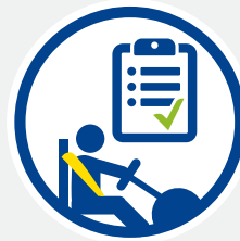
03. JOURNEY MANAGEMENT