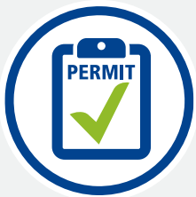
05. PERMIT TO WORK