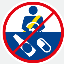
02. DRUGS AND ALCOHOL