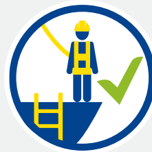
07. WORKING AT HEIGHT