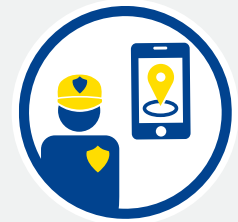
04. PERSONNEL SAFETY AND SECURITY